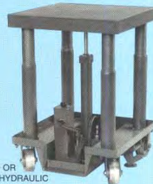
FOOT OPERATED OR ELECTRIC HYDRAULIC

The above "compact" models include (2) rigid & (2) swivel 6" dia. steel casters and (1) floor lock.