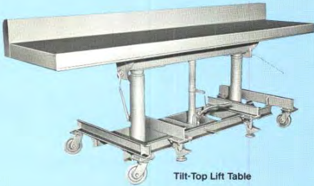
Tilt-Top Lift Table