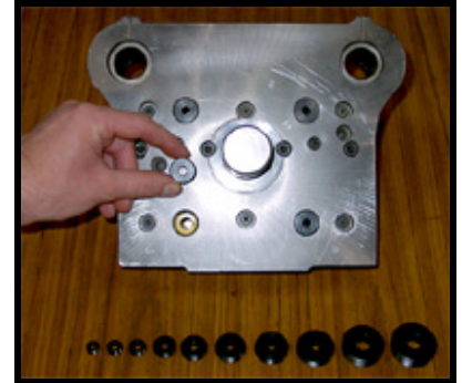
Manufactured of 1018 steel, case-hardened with a black oxide finish and a hexagon opening. Available in a wide range of sizes from 7/16" to 1-3/4" diameter.